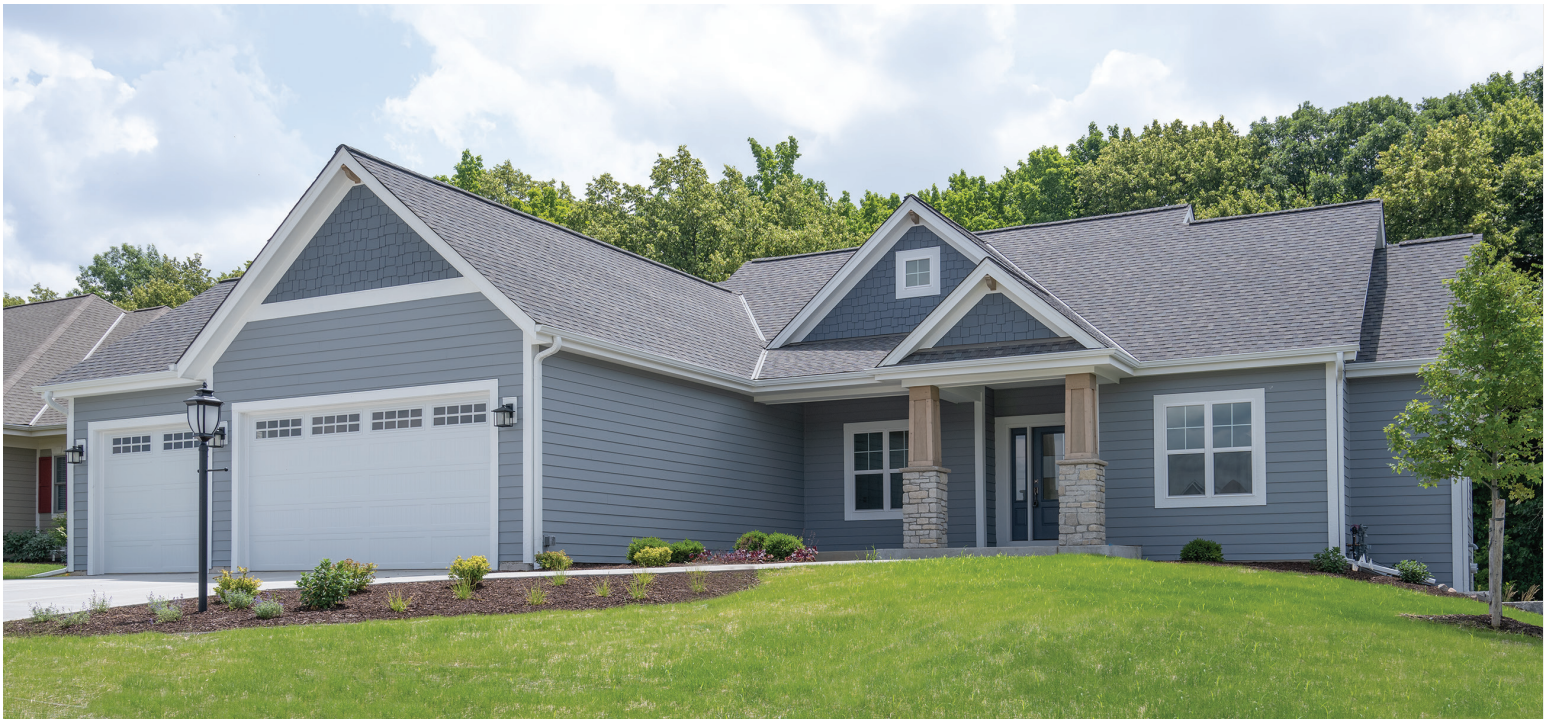
Shown with optional 3-car garage and architectural details