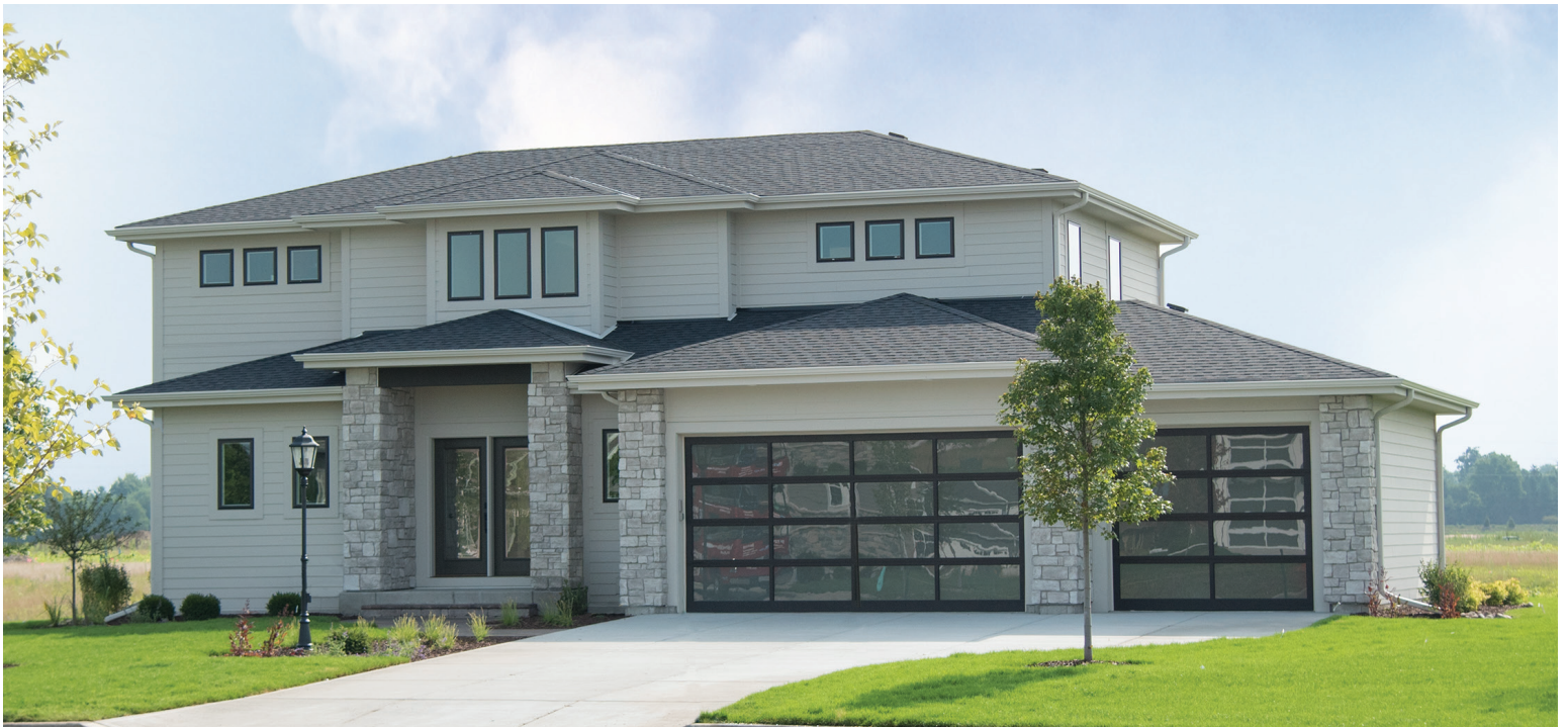
Shown with front facing garage and optional architectural details