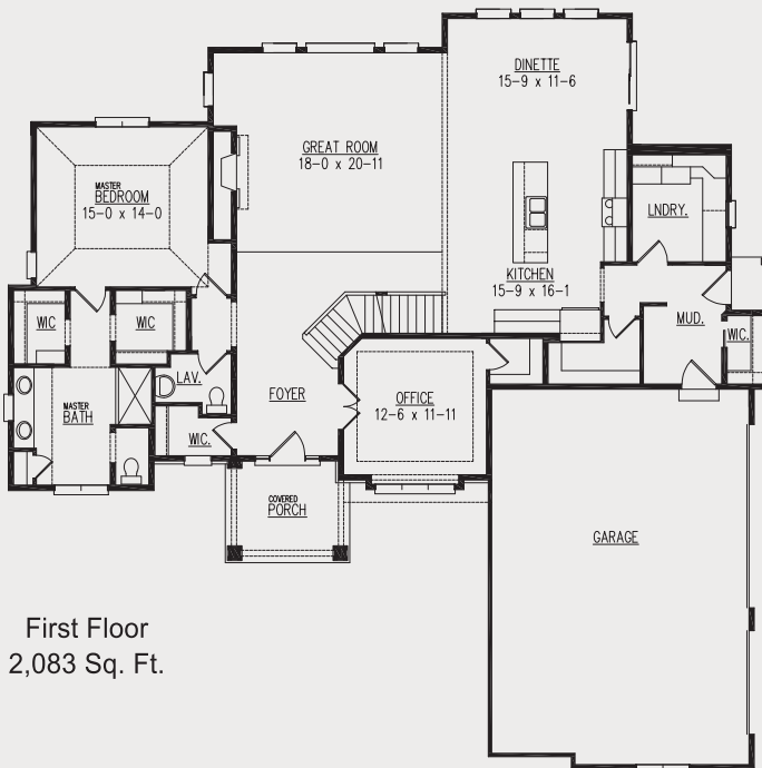
First Floor 2,083 Sq. Ft.