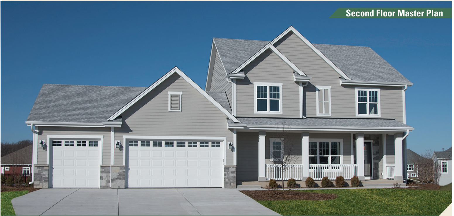
Shown with optional 3-car garage and manufactured stone