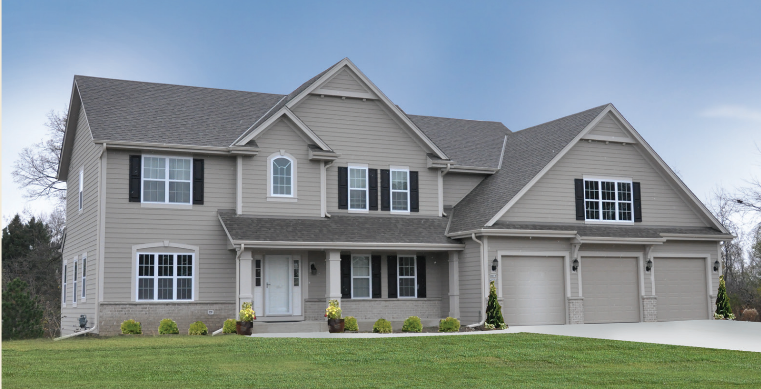
Shown with optional 3-car garage and brick