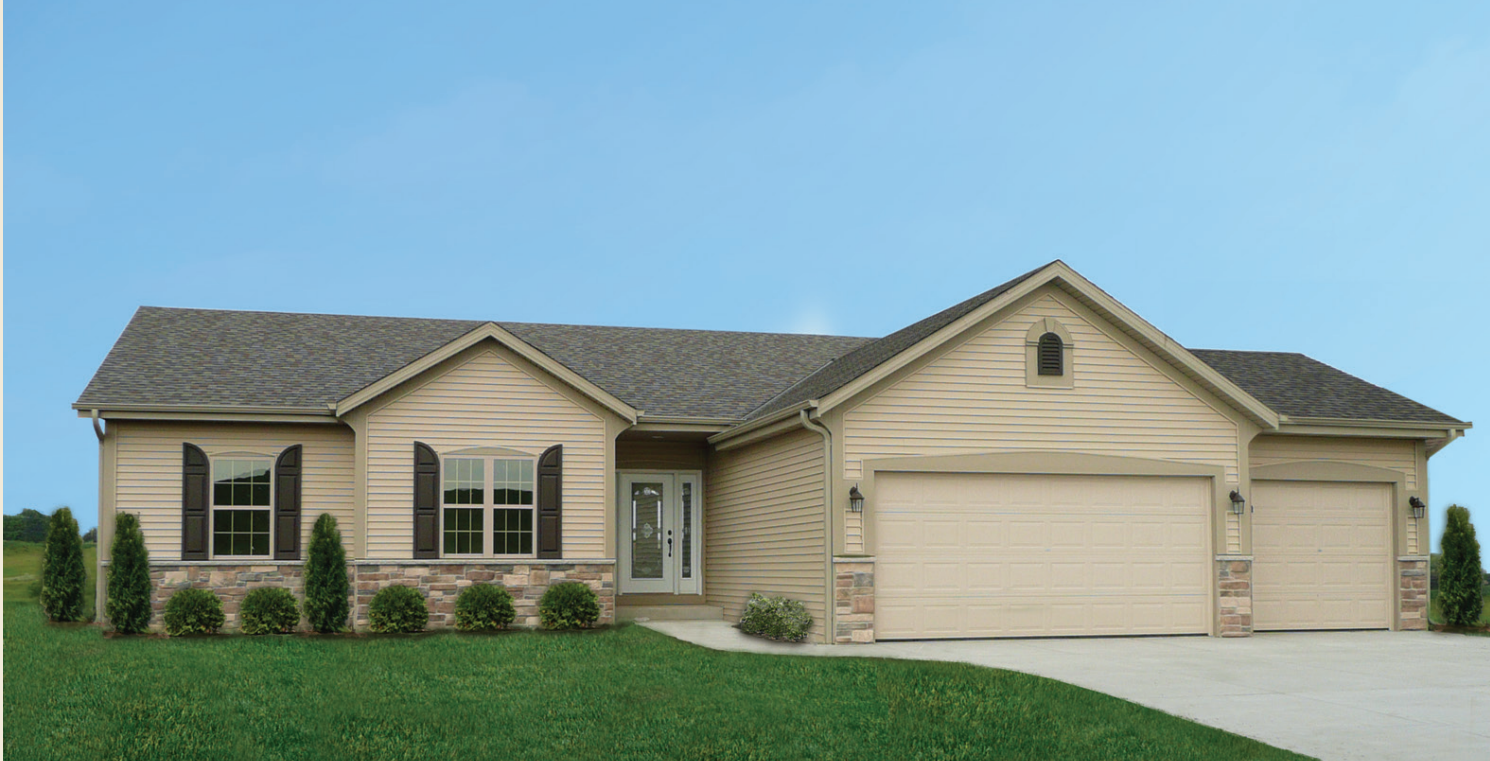
Shown with optional 3-car garage and manufactured stone